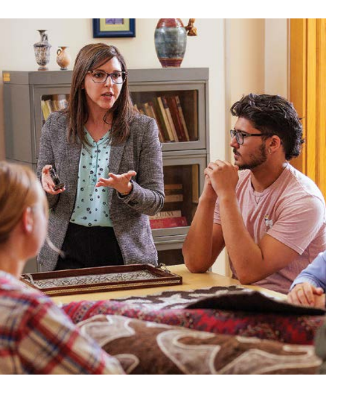
Get started → cortland.edu/transfer

If you have enrolled in any college-level courses since graduating from high school, you will be considered a transfer student when you apply to SUNY Cortland. Approximately 750 transfer students choose us each year. They discover strong academic programs and a campus with transfer-specific resources to ensure their success. We hope you'll join them.